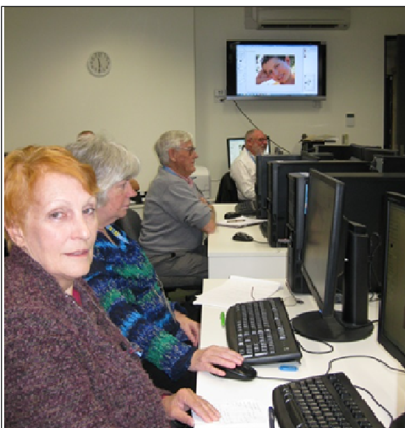
Photo Manipulation started its first course this year as Digital Photo Books and has gone on to change